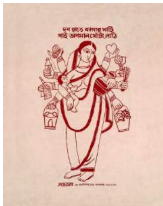
Figure 3. Meri Biwi kaam nahin karti (from Zubaan Poster Women Collection)

A lot of posters started to use goddesses and show her hands full of household work. The need to do this was actually because there was a huge devaluation of women's work and there was a need to recognize women's productive labour.