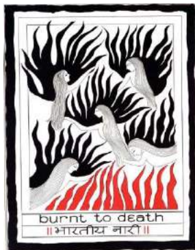
Figure 1. Brides are not for burning (from Zubaan Poster Women Collection)

A photograph from one of the anti dowry protests in Delhi. Dowry was one of